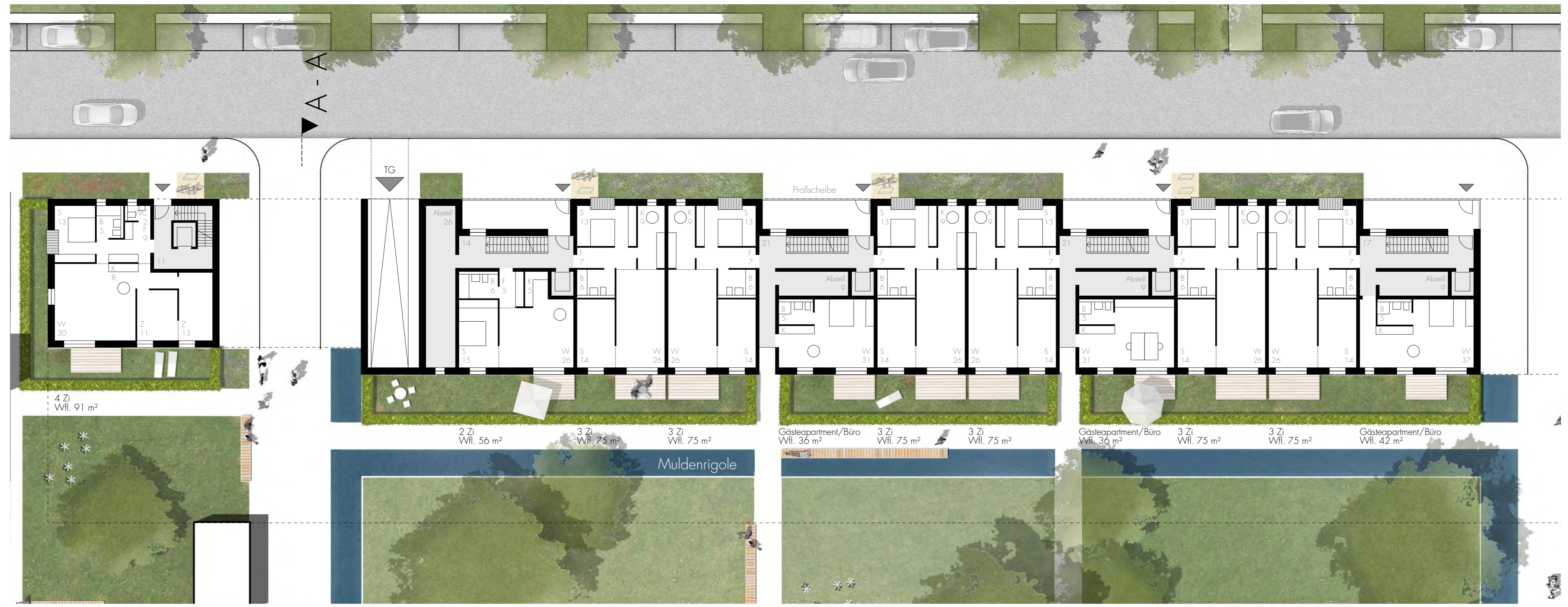
Erdgeschoss M 1:200