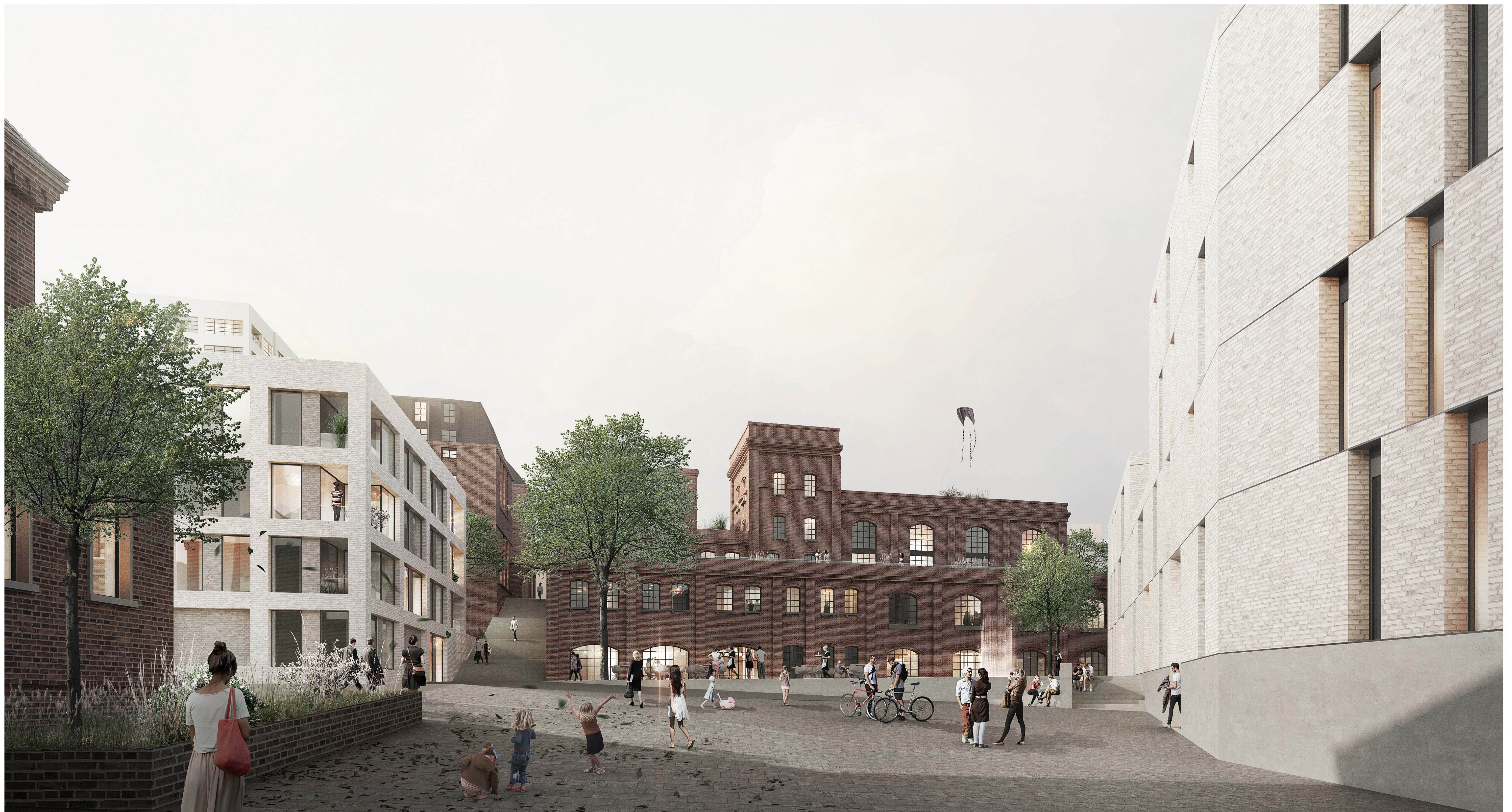
Perspektive Schillerstrasse_Blickrichtung Süd