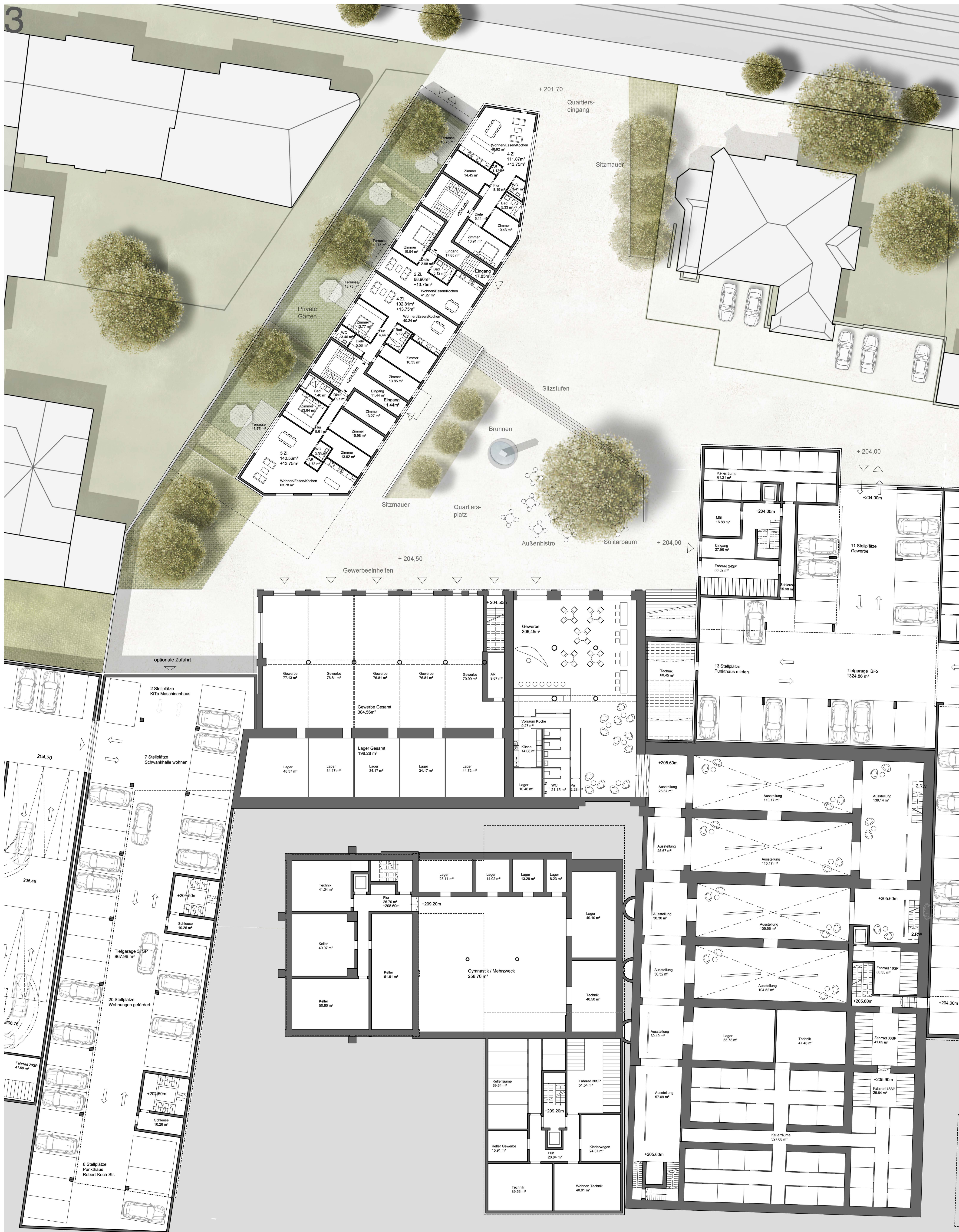
Grundriss Erdgeschoss BF2 unten_Ebene 204,50_M 1:200